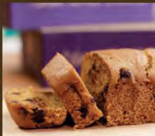
Specialty Tea Loaves

Great Harvest Bread Co. Your Neighborhood Bakery