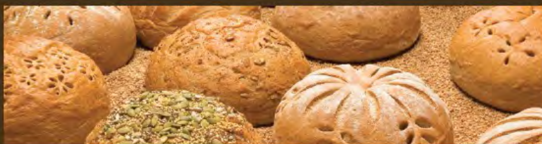
Whole Grain Breads

Register and donate at Paulsrideforlife.org