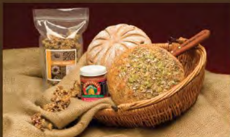
Great Holiday Gifting Options